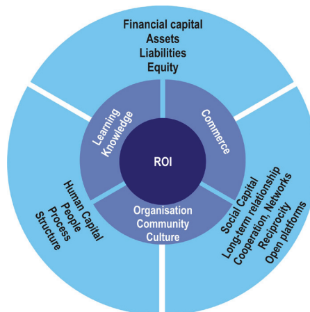
Figure 1: Types of capital

The classification of capital into physical, natural, human, social, and financial capital has a special importance and suggests complexity of the research into the ways and methods of its quantitative increase and qualitative improvement (Figure 1). Regardless of the form of capital, it is important that it: a) contributes to the production of goods and services, i.e. economic growth and development, b) brings profit, and c) represents input in the process of creating economic value (Cvetanović & Mladenović, 2013).