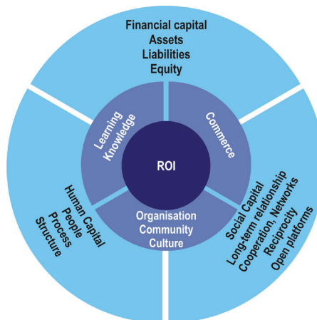
Figure 1: Types of capital

The classification of capital into physical, natural, human, social, and financial capital has a special importance and suggests complexity of the research into the ways and methods of its quantitative increase and qualitative improvement (Figure 1). Regardless of the form of capital, it is important that it: a) contributes to the production of goods and services, i.e. economic growth and development, b) brings profit, and c) represents input in the process of creating economic value (Cvetanović & Mladenović, 2013).