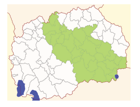
Figure 1. Wine route

The wine tourism in Macedonia is relatively new type of tourism, which is identified in strategic documents (up-date of the National Strategy for Tourism Development 2011-2015) as separate cluster for regional tourism development. The reasons for such a delay, lays in the fact that the wine was not observed as a possibility for economic development in terms of application as material and spiritual cultural heritage. Side by side with France, Italy and Spain, Macedonia belongs to the so called "old wine countries".